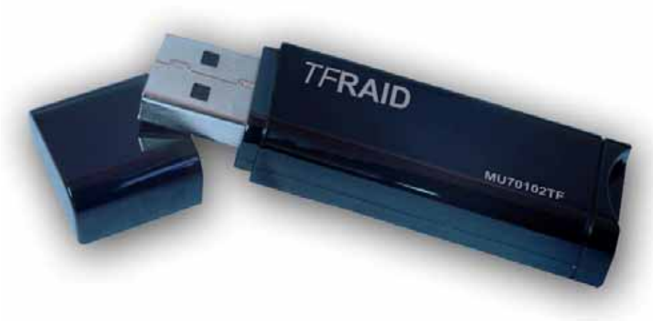
Fig 1. MU-70102TF photos